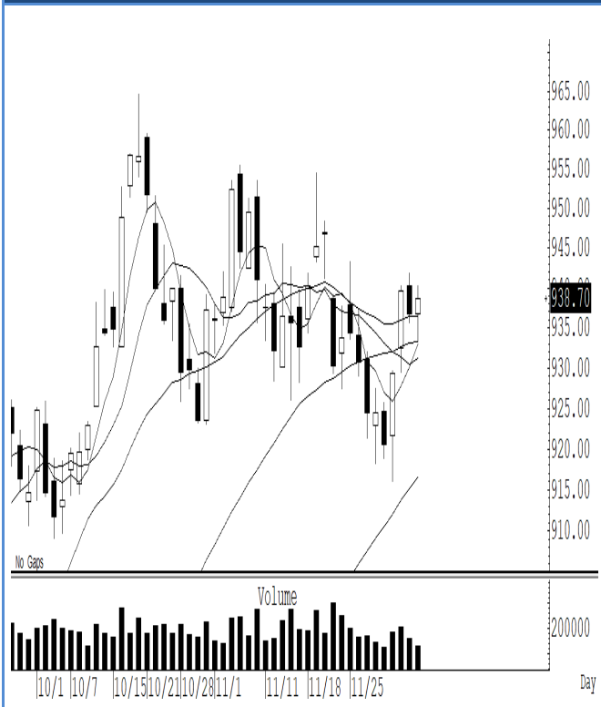
S50Z24 (Close 938.70 Chg -2.90)